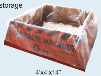
Capacity: 0.68 cu. yards/140 gallons