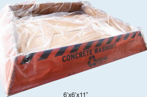
Capacity: 1.33 cu. yards/260 gallons